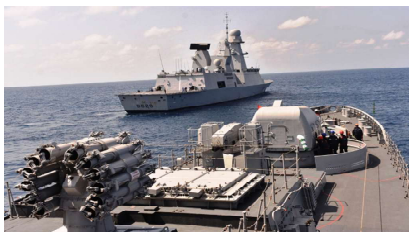
The vessels which participated in Naval Exercise - "Varuna 2021" (File Photo)

Various units including ships, submarines, maritime patrol aircraft, fighter aircraft, and helicopters of the two